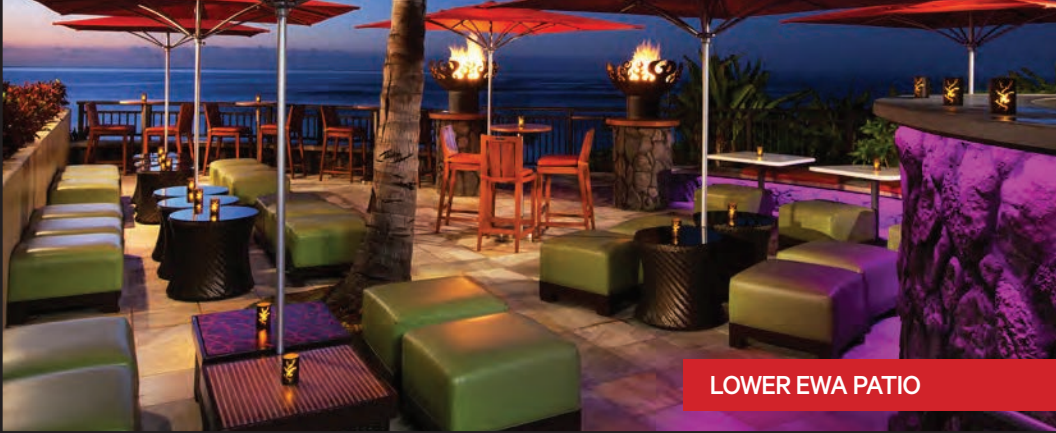
LOWER EWA PATIO