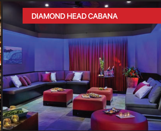
DIAMOND HEAD CABANA