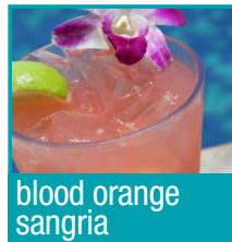
blood orange sangria