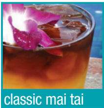
classic mai tai

patrón silver tequila, triple sec, lime juice, sweet & sour, choice of strawberry, guava, mango, pineapple, lime or banana