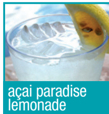
açai paradise lemonade